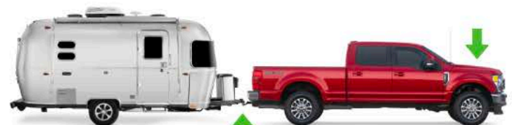
With Weight Distribution Hitch