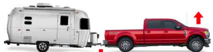
Without Weight Distribution Hitch